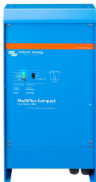
MultiPlus Compact 12/2000/80

When connected to the Ethernet, systems with a Color Control GX or other GX device can be accessed and settings can be changed remotely.