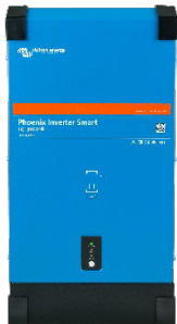
Phoenix Inverter Smart 12/3000