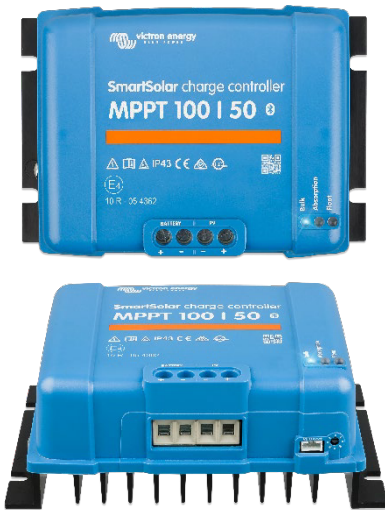
SmartSolar Charge Controller MPPT 100/50